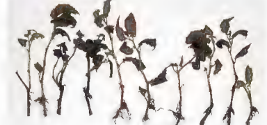
(d) Treat at 7 days after sticking Avg # of roots/cutting rooted: 22.1 Leaf formation: some leaf loss, no shoots

Dates: April 23-May 17, 2010. Photos taken at Day 24