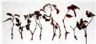
(b) Treat at 3 days after sticking Avg # of roots/cutting rooted: 20.7 Leaf formation: some leaf loss, no shoots