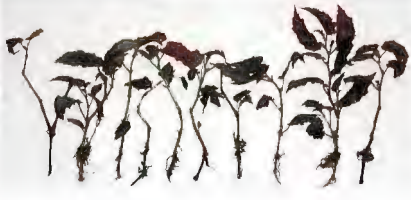
(a) Treat at 1 hr. after sticking Avg # of roots/cutting rooted: 27.2 Leaf formation: shoots