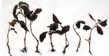
(c) Treat at 5 days after sticking Avg # of roots/cutting rooted: 22.0 Leaf formation: some leaf loss, no shoots