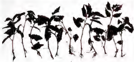
Control Avg # of roots/cutting rooted: 18.9 Leaf formation: shoots