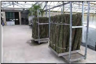
Dutch nursery. Stem rose propagation using the basal long soak method.